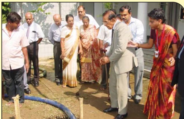
Laying the foundation stone for the Noel and Nora Bartholomeuz Training Centre & Auditorium on 11 th December 2005

He was President of the Sri Lanka Medical Association in 1967 and continued to serve the Association by attending most Orations and meetings, always giving that extra bit of encouragement to young orators for their scientific work. He was also Editor of The Ceylon Medical Journal.