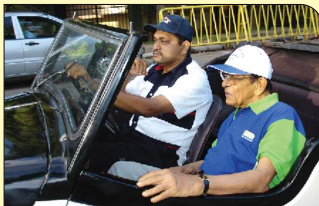
In a vintage car at the Surgeons Walk, December 2005.

And he had time. It is said that to the lazy man there is always no time but for the busy man there is always some time. He had time to consult, time to operate, time to attend weddings, funerals, meetings lectures, scientific sessions and time to do all this, often within the space of a day. He served as Chancellor of the University for a record period of 21 years. He had time to attend every convocation and to stand for hours wishing every graduate with a smile and a word of advice.